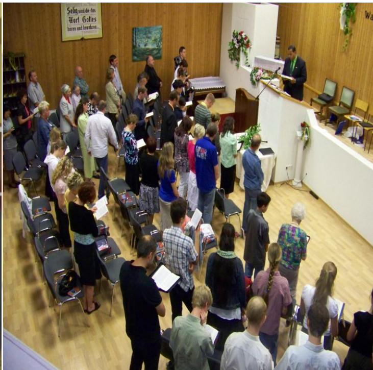
Preaching at Bibel Baptisten Gemeinde - Bassenheim, Germany

Your servants for the Lord Jesus Christ in Germany,